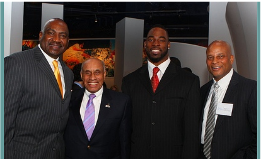
The 2nd Annual Sports, Business & Philanthropy Luncheon honored this year's Bill Walsh Champion of Change Award, George Martin, and All Stars announced a new partnership with Justin Tuck of the New York Giants. (From left: George Martin, Willie O'Ree, Justin Tuck and Ronnie Lott)

Click here to make an end-of-year donation to All Stars