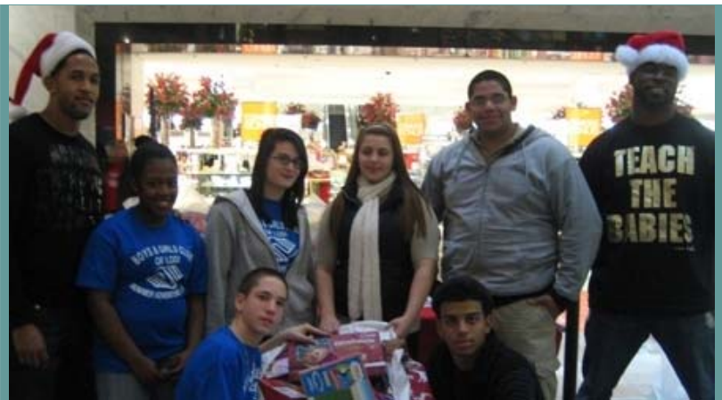
Justin Tuck and Terrell Thomas join members of the Boys & Girls Club for a New Jersey Toy Drive.

The night before the All Stars Helping Kids 2nd Annual Sports, Business & Philanthropy Luncheon , Justin Tuck and teammate Terrell Thomas signed team pictures at a mall in New Jersey as part of a toy drive with the Boys & Girls Club. The drive attracted lines of generous fans and brought in hundreds of toys for underprivileged children.